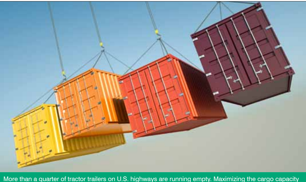
More than a quarter of tractor trailers on U.S. highways are running empty. Maximizing the cargo capacit is an easy way to move goods more efficiently.

Similarly, Kraft Foods realized that trailer weight and space capacity were being underutilized in its Vendor Managed Inventory (VMI) system. For instance, due to the variety of products either cubing-out (reaching the trailer volume limit) or weighing-out (reaching