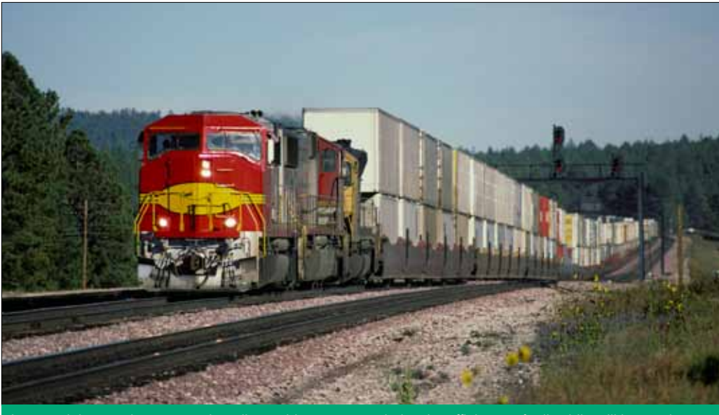
Intermodal ground transportation allows shippers to maximize the efficiency of rail, while still leveraging the flexibility of trucks.

Pressure to keep inventory levels low is one of the greatest barriers to increased utilization of more carbon-efficient modes. The cost of financing inventory is a major expense. It also requires