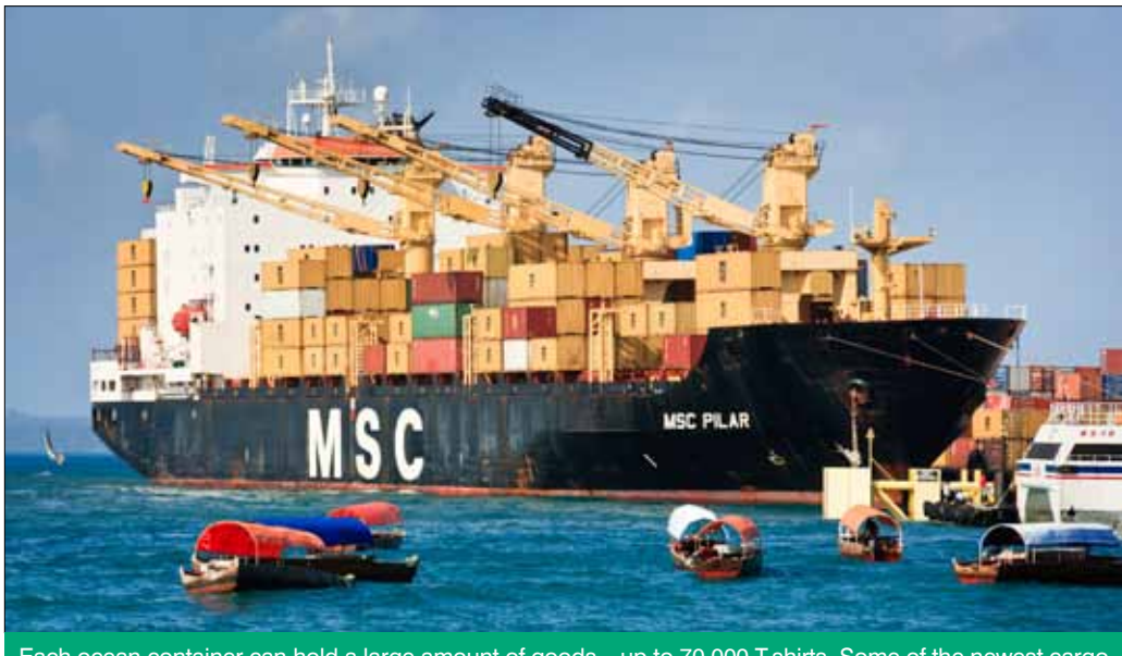
Each ocean container can hold a large amount of goods – up to 70,000 T-shirts. Some of the newest cargo ships can hold up to 18,000 containers.

freight to ocean freight while still meeting time and inventory carrying cost pressures. The company changed most shipments of its Visual Collaboration studio—a TelePresence conferencing system—to ocean freight. This resulted in a savings of $7,000 and nearly 900 tons of carbon per shipment.<sup>10</sup>